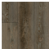
5005 Tuscan Ash