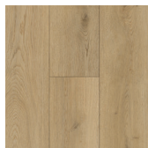
5001 Caribbean Beech