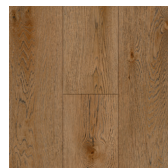
5008 Frisco Oak