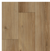
5004 Tropical Walnut