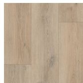
5007 Sandalwood Koa