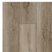
5006 Yellowstone Oak