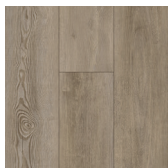
5002 Charleston Pine